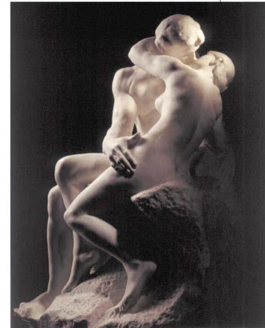
Figure 2. The Kiss : the couple in Auguste Rodin's masterpiece are turning their heads to the right to kiss each other.

Of the 124 couples, 80 (or 64.5 percent) turned their heads to the right and 44 (or 35.5 percent) turned to the left .